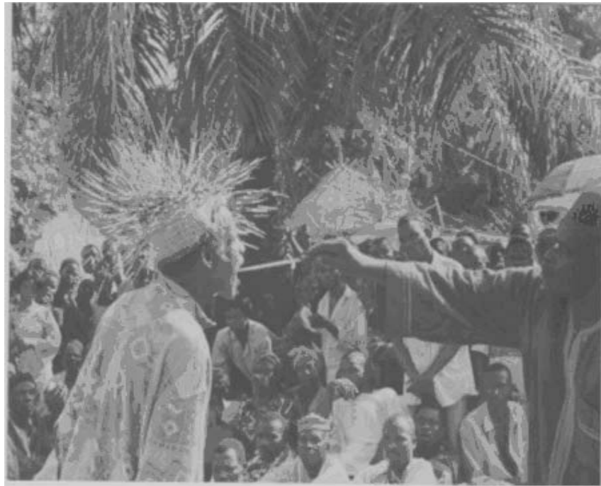
Fig. 5: The chief priest feeding a warrior

allowed to stay for a few seconds. The priest picks up the slices with the tip of a knife, holds it out for all to see while the warrior to be fed stands out, hands behind his back. He takes the piece of yam with his teeth. This process of feeding the warriors continues until every warrior physically present is fed. Once this is done, the deceased hero would be laid to rest.