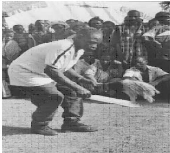
Fig. 6 The chief priest doing a solo dance, round the shrine

Apart from serving as a mark of honour to the dead warrior, this scene also signifies transition, authority and dexterity; here the right of performance is shifted to a living son, brother or relation. As the priest beheads the chicken, possible successors, who are placed strategically around the arena (in most cases the warrior's children), struggle over the head and whoever picks it automatically succeeds the warrior. In the event that the head is picked by a member of the audience, the family members will pay a fine to retrieve it from such a person. Also, if picked by one who is not interested in the dance, he hands it over to a willing brother or relation for a token. It is also noteworthy to mention that some expertise is displayed by the priest, where a particular person is favoured to succeed the dead warrior. The hen is beheaded in such a way that the head falls closest to such a candidate.