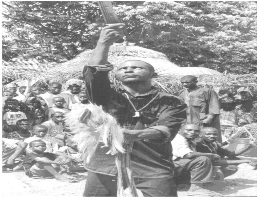
Fig. 3 A warrior hero points the machete to the sun

The third round or scene is essentially a solo performance, where a warrior – hero comes out to narrate the story of his valour, using the music and rhythm of the drum. Every warrior has a pet name that is coded between the warrior and the lead trumpeter ( Nomkor ). The trumpeter calls the warrior with such a coded name; he jumps in from amongst the audience with mild emotions and excitement. He prowls around the arena looking towards the east and west, with an eventual sharp step towards the drummer. He brandishes the machete as if threatening to cut off the drummer's head and finally settles for his dance. Movement at this time consists of elaborate and vigorous thrusting of the body and leg movement to the dictates of the drum. With an abrupt seizure of sound from the music stand, the dancer lies flat on the ground, and another member-hero appears almost immediately, places the flat blade across the neck of the prostrate figure, mimetic of the act of beheading a man. This episode continues until all the heroes appear on the stage.