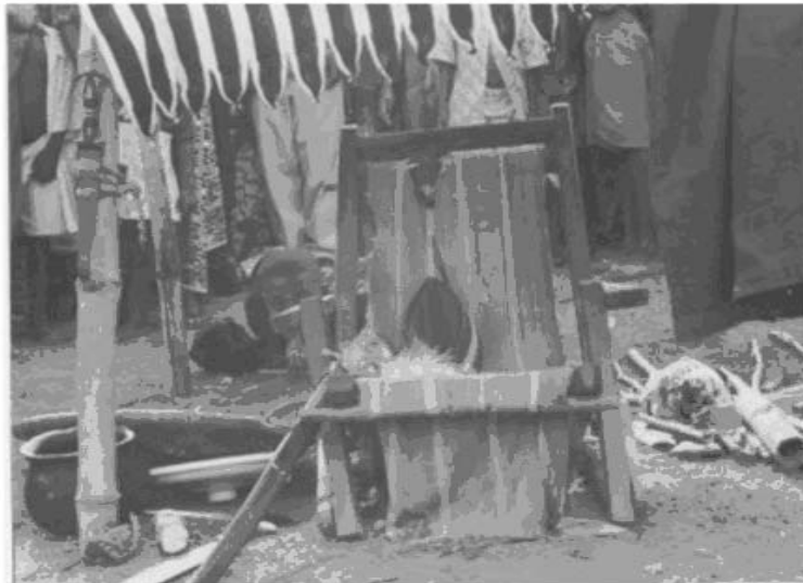
Fig. 1: An erected shrine housing the dead warrior's accessories

(traditional Tiv hand-woven cloth of black and white colours) around which a protocol of events seeking to cleanse both the dead member and living warriors from presumed stains is carried out. This shrine usually also houses the corpse of the dead warrior member. But for some health reasons, arising from modernization, only the accessories (cap, machete, beads, etc) of the dead member are kept under the shrine to represent the corpse (see Fig 1).