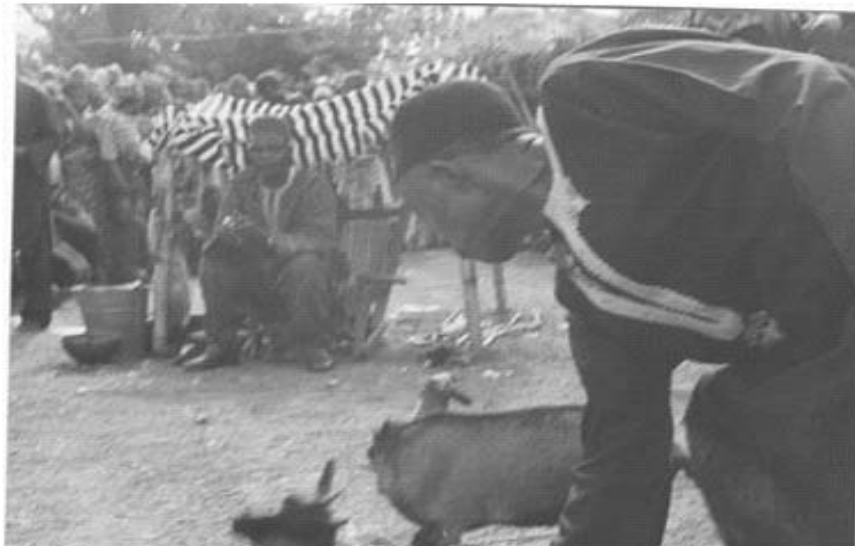
Fig 4: A mandated warrior severing the head of the goat from the body.

stroke. No other person apart from the authorized can attempt to carry out this exercise. The chosen member, because he has the mandate of the other members, can perform this task with ease. The audience and other members of the guild stand in admiration of this personal display of skill by the chosen one while they also pray for a neat cut, for failure means not only a loss to the individual but the entire clan from which he is chosen. The drum beat directs his movement and he moves elegantly around the arena taking occasional long strides towards the goat with bulging bloodshot eyes. This movement is repeated until he is fully satisfied, and ready for action. The music ceases, he looks up and down, throws the machete up and as he catches it mid-air, he then cuts neatly through the goat, amidst cheers from the audience and fellow members (Fig. 4).