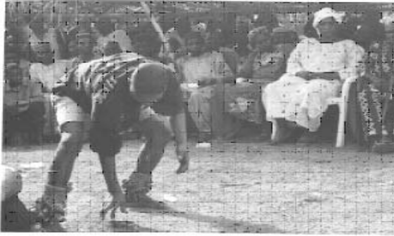
Fig. 7: A prospective warrior picking up the head of the hen preparatory to succeeding his dead father