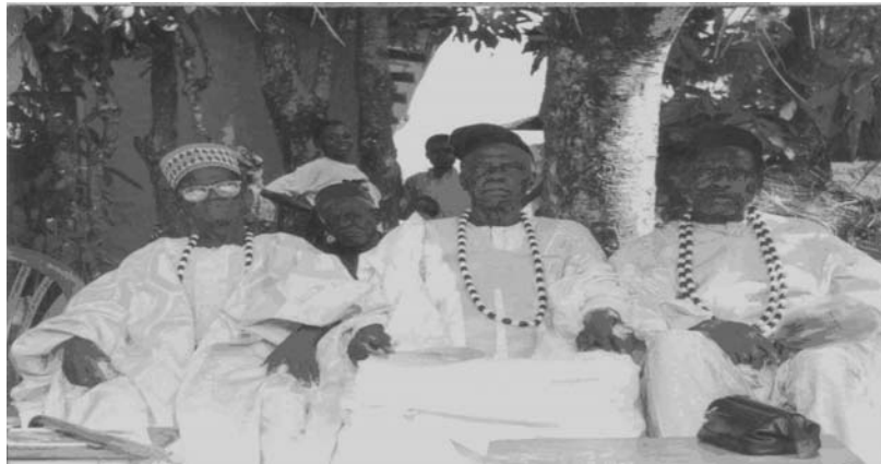
fig. 8: A cross section of traditional rulers in Mbaduka District of Vandeikya Local Government during the burial of a dead warrior - hero.