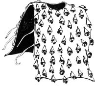
Fig. 1: Izeyin: Small Jingling Bells