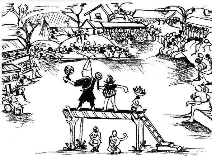
Fig. 4: Ekue'rahu Playing Setting

This kind of theatre setting that has part of the audience watching (looking down) the performance on the booth stage from above (roof tops, upstairs and trees), and the participant-audience on the ground level watching (looking up) from below emphasises the godlike perspective of the key player ( Ekue'rahu ). This is reminiscent of how the Greek actor was perceived (Barnet, Burto, Ferris and Rabkin 2001:7). With the heavens above, Ekue'rahu is equilibrated by a similar action of watching from above (heavens) and below (earth). Taken together suggests the integration of the heavenly and earthly beings communing to enliven a shared spiritual experience. The arrangement further symbolises the Ebiran worldview of a society that operates under divine laws and human norms.